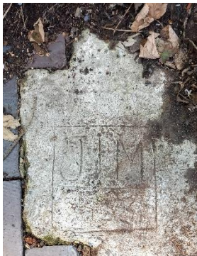
A dog called Jim