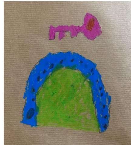
Work by Year Five pupils