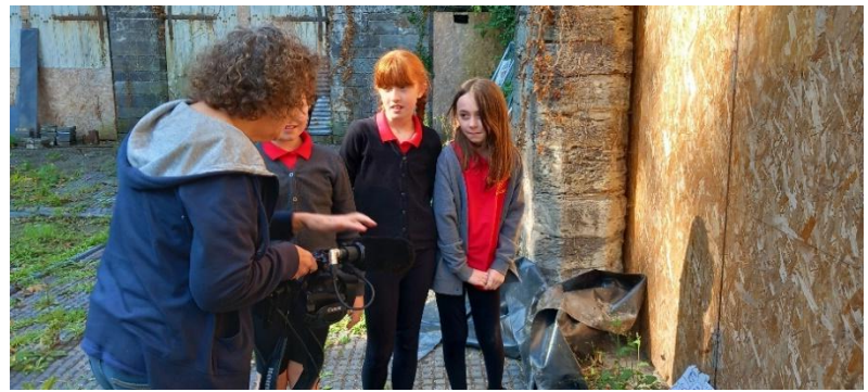
How to use a video camera