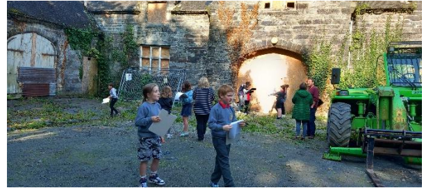
Exploring the Stables yard